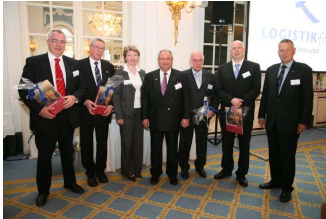
The prestigious panel of experts